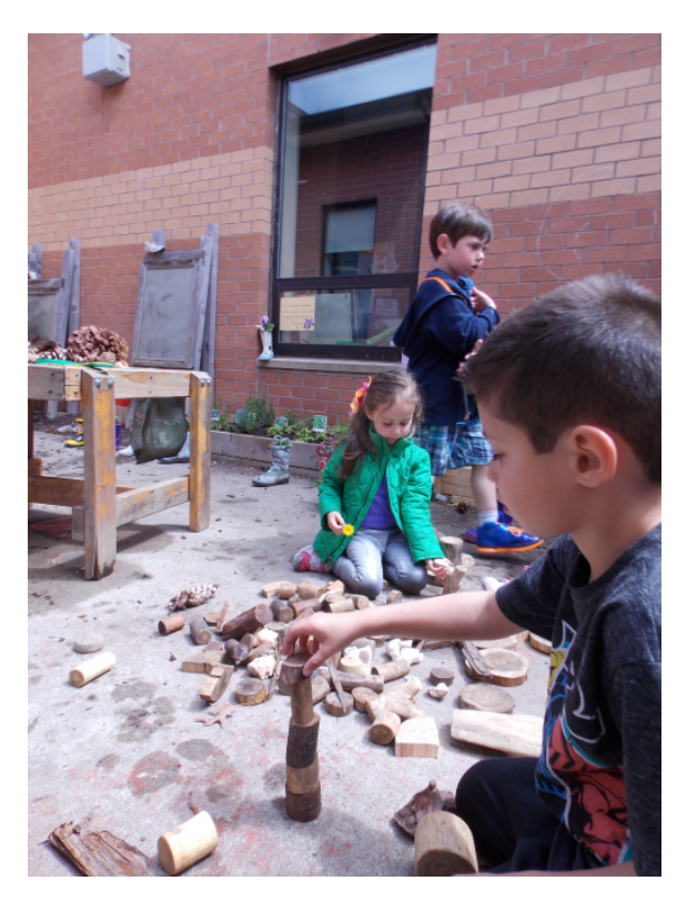
INDEPENDENT PLAY: ALTHOUGH THE SPACE MAY SEEM SMALL AT FIRST GLANCE, IT DOESN'T PREVENT CHILDREN FROM FINDING OPPORTUNITIES FOR PERSONAL ACHIEVEMENTS. THIS LITTLE BOY TRIED SEVERAL TIMES TO GET HIS TOWER BALANCED JUST RIGHT.