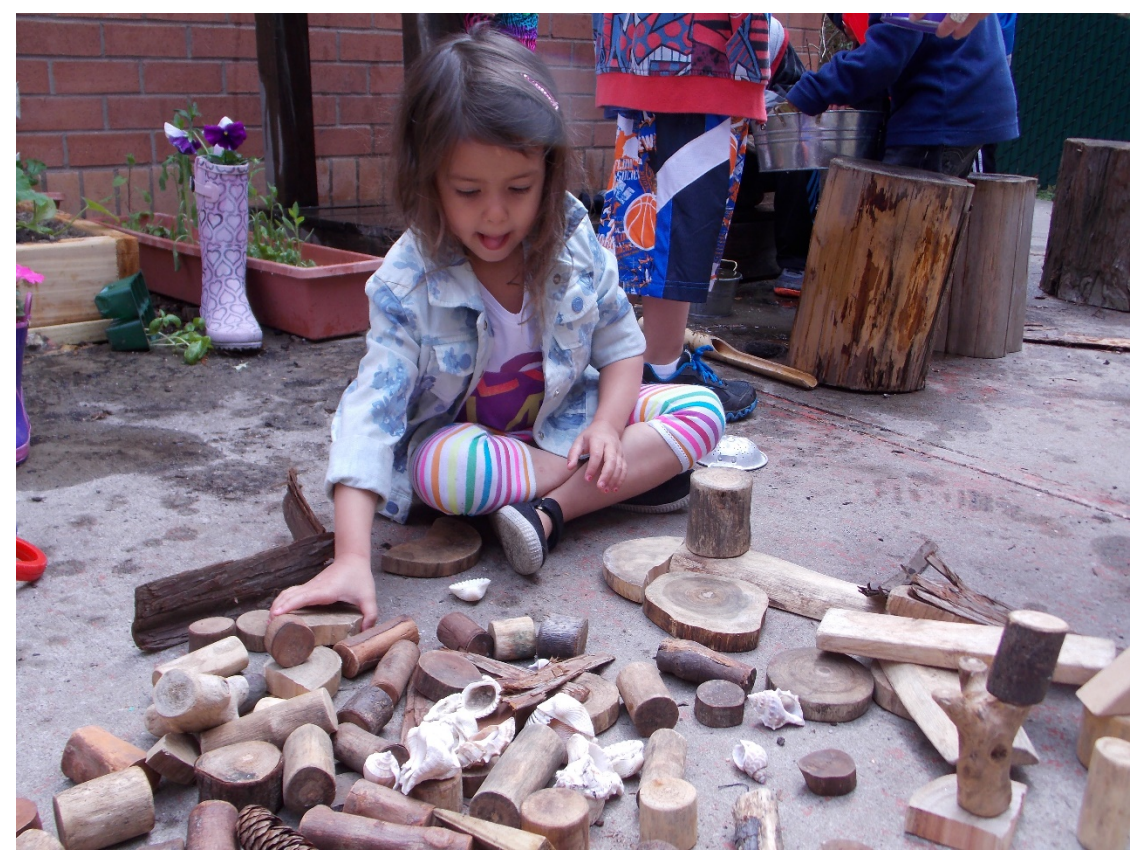
CONCENTRATION: THIS LITTLE GIRL WAS SPYING THE THREE PIECES OF STACKED WOOD IN THE LOWER RIGHT CORNER OF THIS PICTURE AND WAS SEARCHING FOR JUST THE RIGHT PIECE TO COMPLETE HER OWN WORK OF ART.

As I snapped pictures and heard secondhand stories of the teachable moments that happen in their outdoor classroom each day – even in winter when painting the snow is a favorite activity – I had the chance to ask Barbara and Tara about the evolution of their classroom, and what they were eager to share with me from this past year. Considering North Shore Synagogue holds the distinction of being one of the first Synagogue-based preschool settings on Long Island to create an intentional outdoor classroom, I thought it would be interesting to learn, what's next. Below is just some of what I witnessed during my tour, and at the end of the photos read a few snippets and observations from my conversation with Barbara, Tara and Allison.